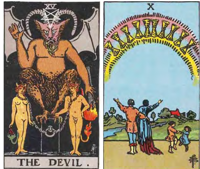
Figure 3: The Devil and Ten of Cups cards from the major and minor arcana respectively. Both of these illustrations are from the Rider-Waite-Smith tarot deck. Tarot card images are in the public domain.

This template was chosen as it mimics the style of a movie poster tagline. A season is chosen at random from spring, summer, fall, or winter. The rest of the tagline is created using one of the fortune-telling meanings from the Inciting Incident (card 1) in our spread. As mentioned above, the fortune-telling set of meanings are written in second-person and are future facing, and therefore work well for the tagline structure. Samples of generated taglines are: "THIS WINTER, WATCH OUT FOR ENVIOUS FRIENDS", "THIS SUMMER, ROMANCE IS IN THE CARDS", and "THIS SPRING, YOU'LL BE PLANNING A TRIP". Because the tagline is filled out using a card from the spread that is also used to generate the story synopsis, it