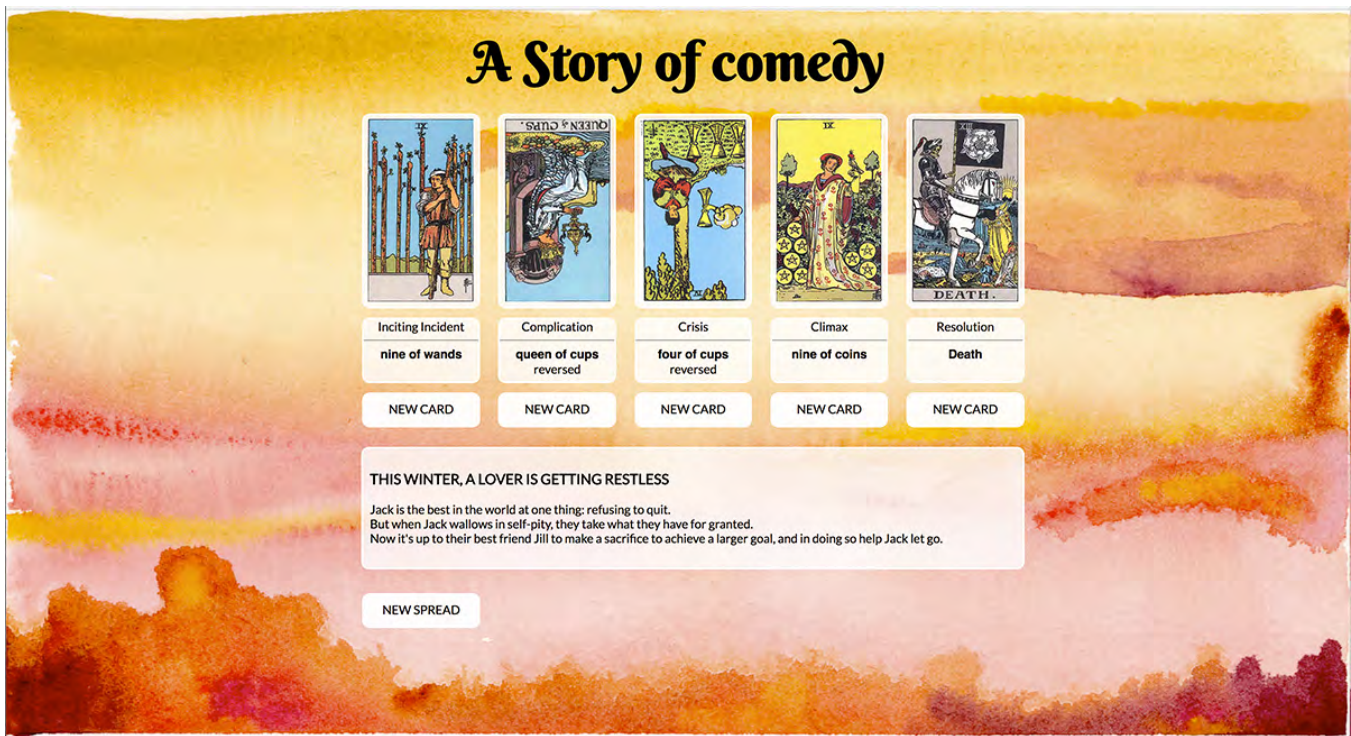
Figure 1: A screenshot of the Tarot Narrative system displaying a comedy-based story. Tarot card images are in the public domain.

with each act denoted below each one. Some cards are upright, and others are reversed, and they are displayed in that orientation. Each card is also labeled along with its orientation below the images of the cards. Below that is a section that shows the tagline for the story and the story synopsis, generated from a story framework and integrated with the meanings of the drawn cards. The interactor may draw a new card for any of the five locations, which will draw from the remaining cards in the deck. They may also draw an entirely new spread, which will draw a new set of 5 cards using the entire deck. The background of the webpage will change to a different watercolor painting to match the mood of the story; oranges and yellows are used for comedy 1, and blues and greens are used for tragedy 2.